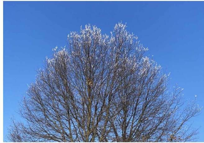
Hoar frost melts from the bottom up. Who knew?